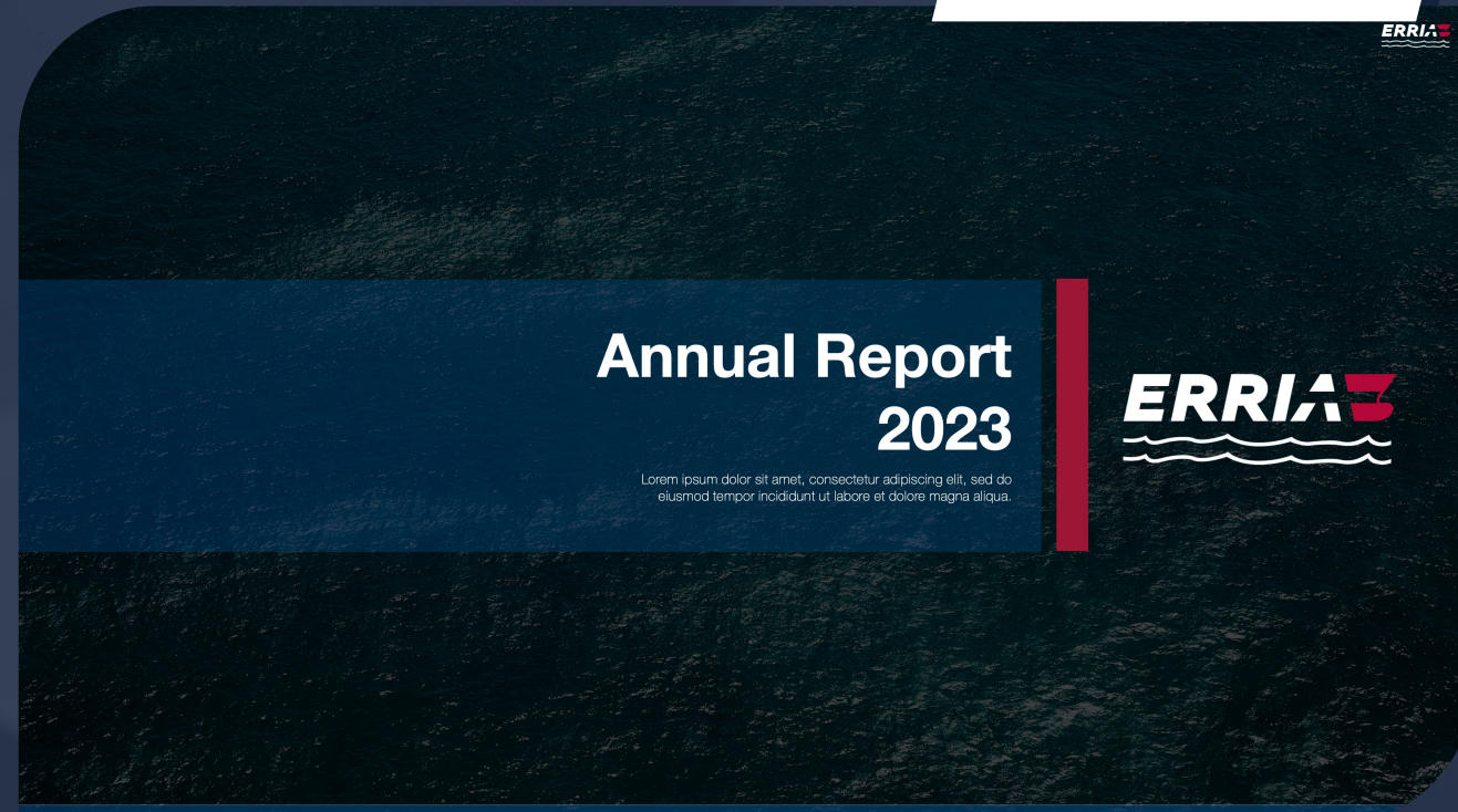
Source: Annual report made for Erria